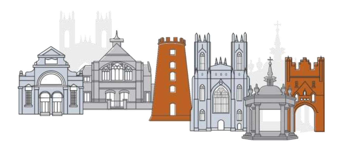
Pillar 3 Disclosure Document of Beverley Building Society for the year ending 31 December 2023